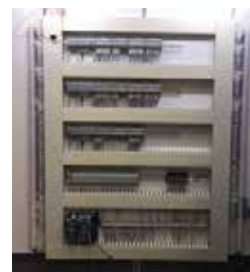
Remote I/O Panel