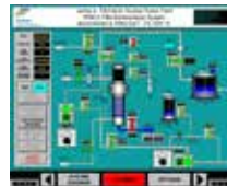
HMI Backwash & Precoat