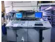
Process Simulator Panel