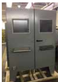
Main HMI Panel

5215 Hellyer Avenue Suite 210 San Jose, CA 95138