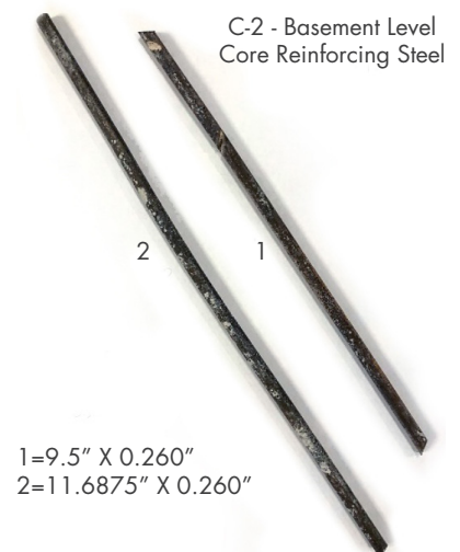
FIGURE 1. The core reinforcing steel samples in the as-received condition.