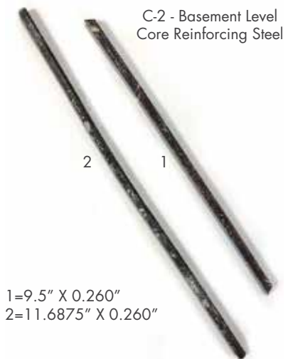
FIGURE 1. The core reinforcing steel samples in the as-received condition.