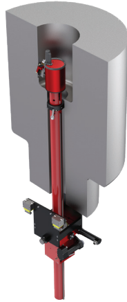
Small Bore Scanner