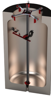
In Vessel Scanner