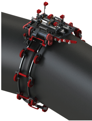
High Density Polyethylene, HDPE Scanner

SI prides itself in designing and building custom scanners in house to meet its customers needs.